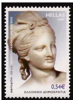
Scott no. 2328