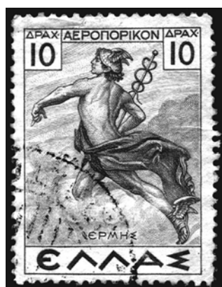
Scott no. C35

In Milan Kundera's The Unbearable Lightness of Being , the protagonist, Tomas, recalls that in Plato's symposium that people were hermaphrodites until God split them in two and now all the halves wander the world in search of each other. In conclusion, love is the longing for the half of ourselves we have lost. From ancient times such a being has been described and deified.