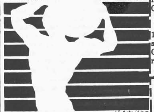
GERTRUDE STEIN PHILATELIC SOCIETY