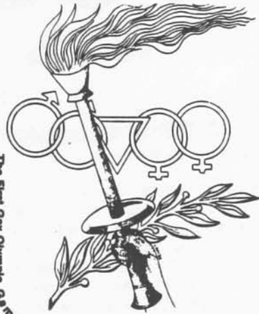
The First Gay Olympic Games