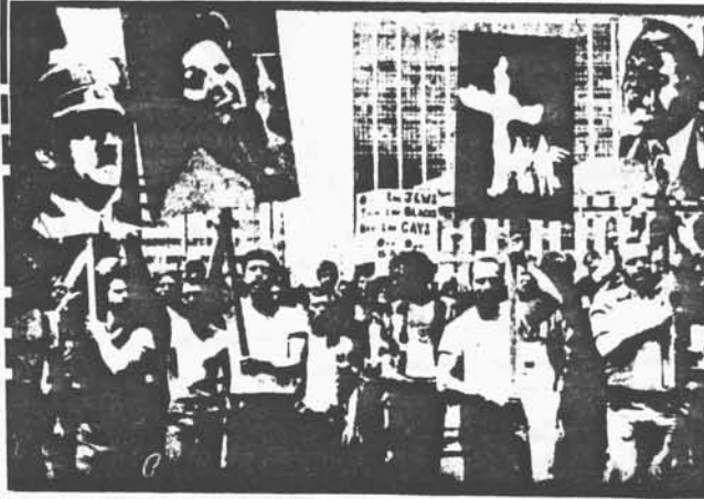
Gertrude Stein Philatelic Society